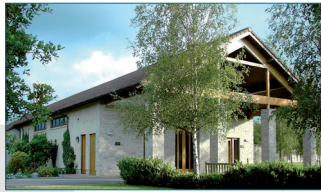
West Wiltshire, Trowbridge