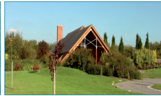
Howe Bridge, Atherton