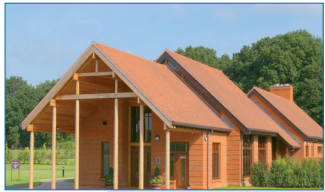
Wessex Vale, Eastleigh

The photographs below show typical examples of crematoria Westerleigh has built elsewhere; you can find more on the website: http://www.westerleighgroup.co.uk/locations.php