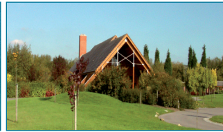
Howe Bridge, Atherton